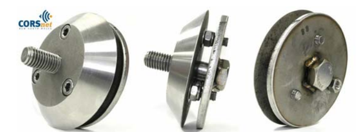
Figure 6: Internal workings of the CORSnet-NSW Adjustable Antenna Mount (CAAM), patent issued.

Using three adjustment screws, the vertical position of the 5/8th Whitworth thread spigot can be adjusted slightly to ensure the antenna is oriented to True North without the introduction of an antenna height (Figure 7). Turning the screws clockwise raises the centre spigot a tiny amount, allowing the antenna more rotation before it tightens. If one screw is rotated more or less than the others, the spigot will naturally try to tilt to one side. However, due to the thickness of the top plate it is not possible to adjust the three screws unevenly to any significant degree. A small tolerance allows the centre spigot enough freedom to move within the top of the mount during the adjustment process, while still keeping it vertical to within 0.25 mm.