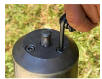
Figure 7: CAAM, integrated into the GNSS antenna monument.

Contrary to conventional antenna mounts, if a GNSS antenna needs to be replaced, the new antenna can be installed and oriented to True North without introducing (or changing) an antenna height and the physical survey mark remains unchanged. Another feature of the CAAM is that after the antenna is in place, the orientation cannot be altered without actually removing the antenna first. This provides an additional level of security. Design sketches for the CAAM are freely available and shown in Figure 8.